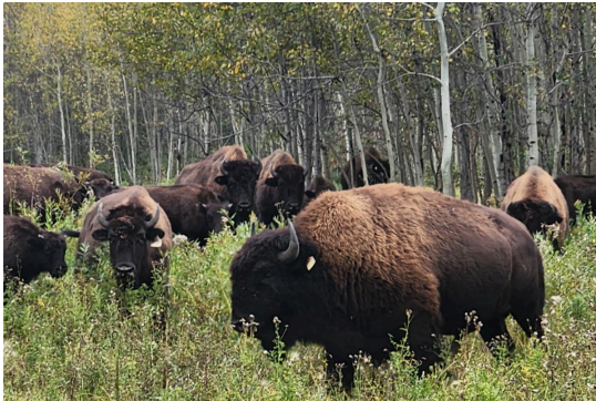
Image: Bison graze and raise their young on Mosquito Grizzly Bear's Head Lean Man First Nation near North Battleford Saskatchewan.