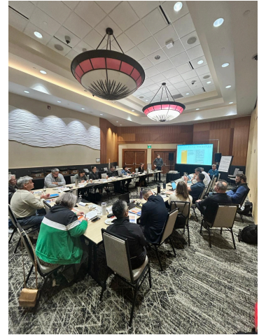
Image: ATR Engagement Session, Dakota Dunes, SK