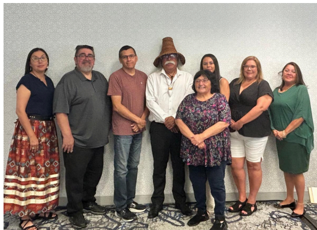
Image: NALMA Board of Directors and Executive Director, August 2024

Thank you for being a part of NALMA's community!